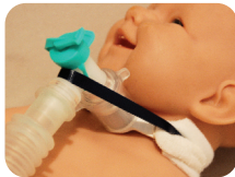
#401P is made specifically for the Pediatric Patient